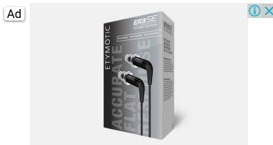
Etymotic Research Etymotic ER3SE & ER3XR IEMs - ER3SE